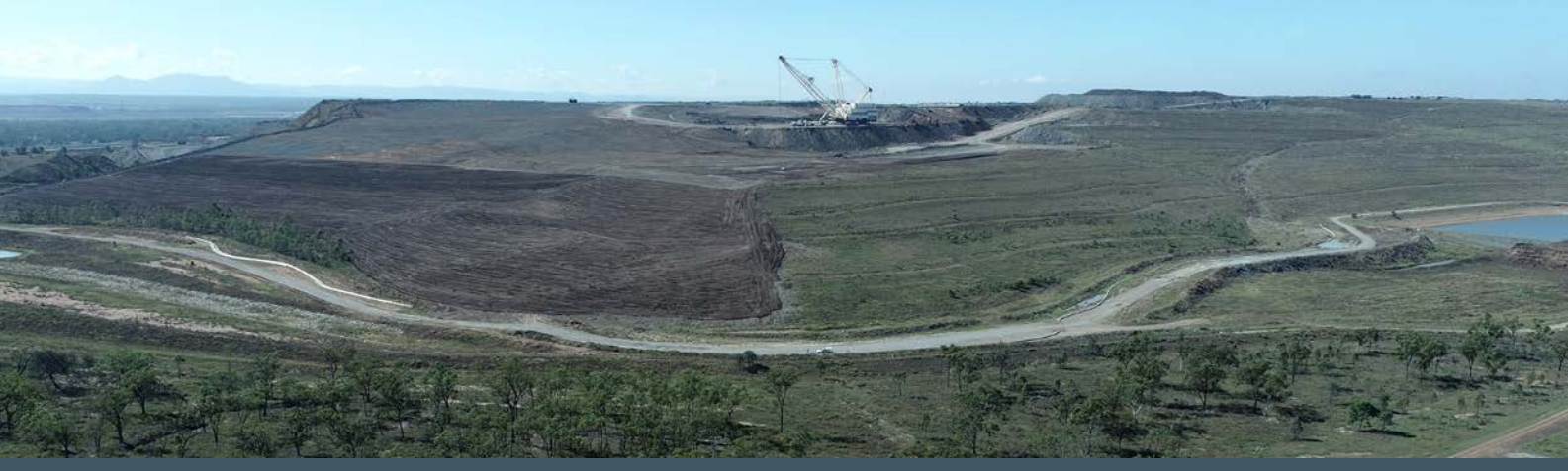
No longer needed for coal production, one of Hail Creek mine's draglines has been re-purposed to shape final landforms.

Progressive rehabilitation at Clermont Open Cut.