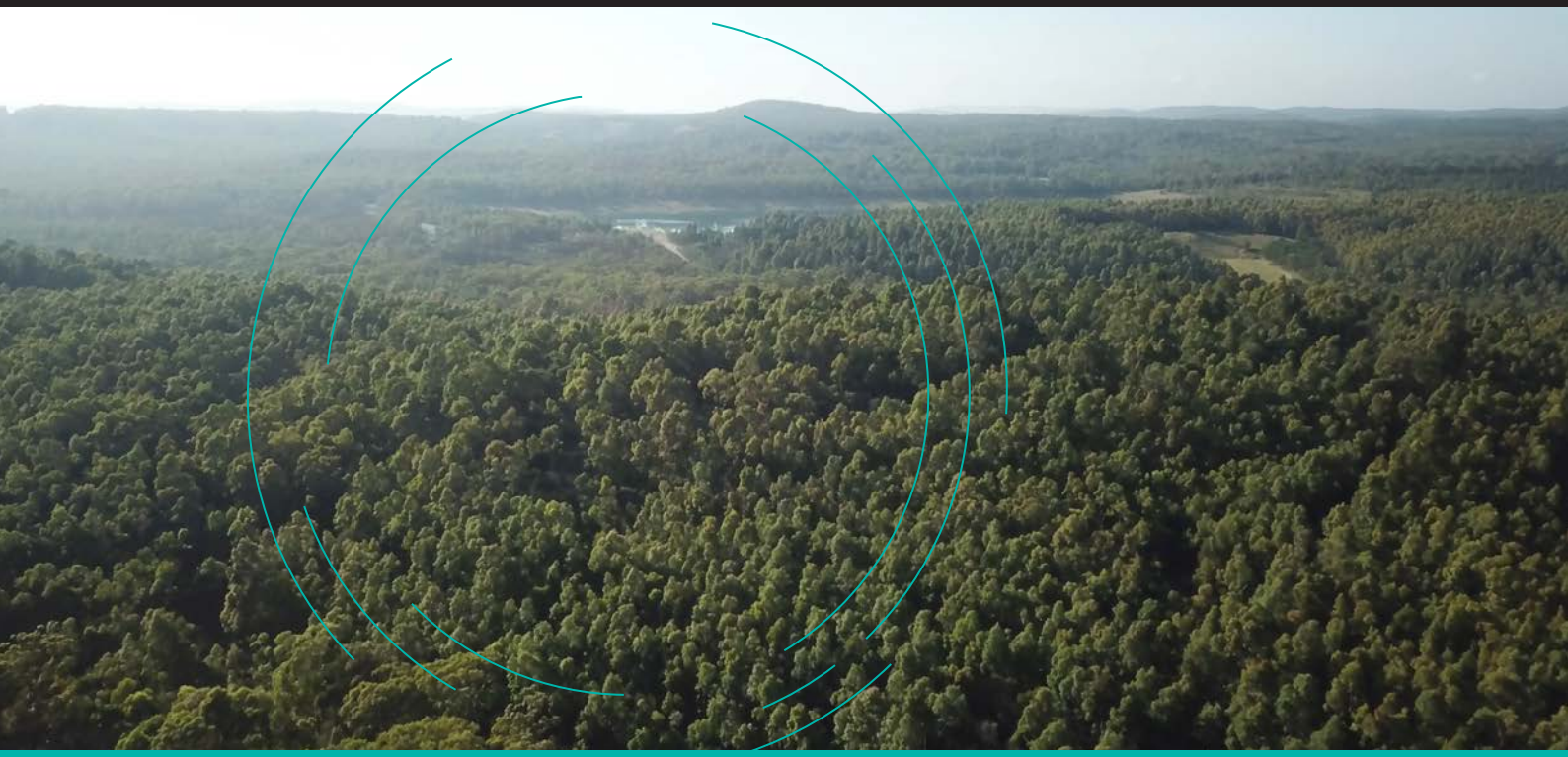
Rehabilitation of the former Westside open cut mine at the Macquarie Coal complex.

Four other sites – Liddell and Newlands open cut, Integra and Ravensworth underground mines – are also in various stages of detailed mine closure planning or works.