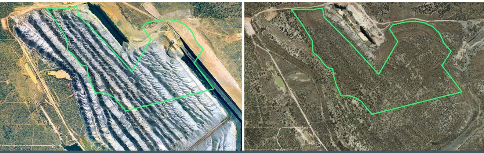
The Grasstree pit at Oaky Creek during mining and after rehabilitation. The green outline shows the area signed-off by Government.