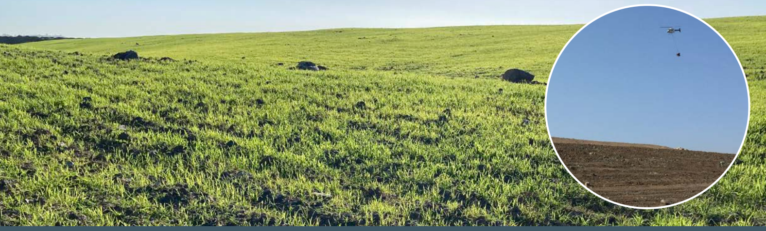
Rehabilitation at Mt Owen mine one month after aerial seeding (inset).