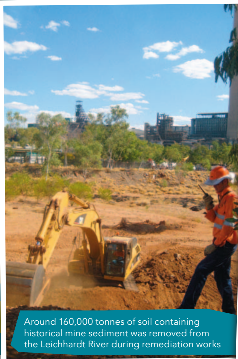
Around 160,000 tonnes of soil containing historical mine sediment was removed from the Leichhardt River during remediation works