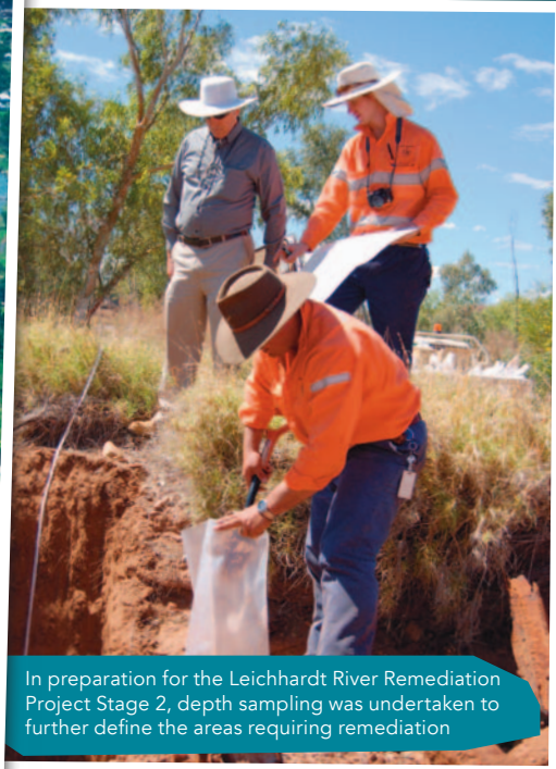
In preparation for the Leichhardt River Remediation Project Stage 2, depth sampling was undertaken to further define the areas requiring remediation

Xstrata Mount Isa Mines commenced the Leichhardt River Remediation Project in mid-2008, as part of a recommendation from the Lead Pathways Study Land Report .