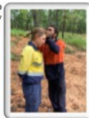
Water quality monitoring with local field assistant