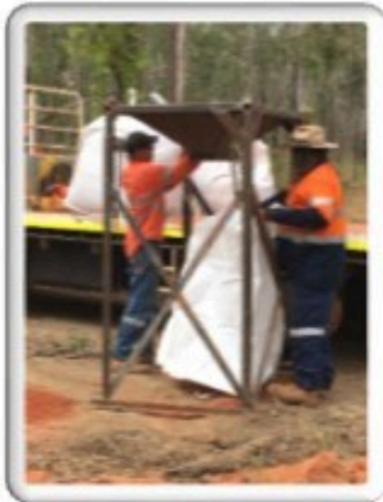
Local contractors performing bulk sample collection