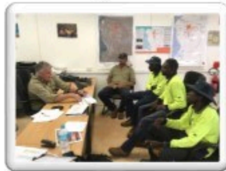
Local workforce inductions