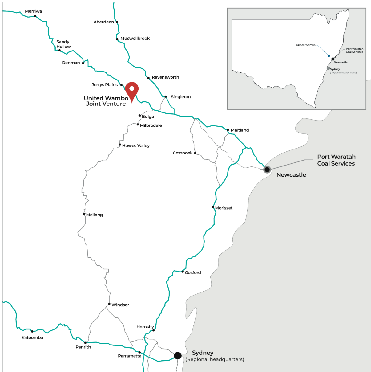
Figure 2-1: Site Locality